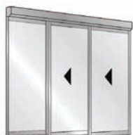
Porte Télescopique 2 vantaux avec Fixe