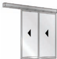
Porte Télescopique 2 vantaux sans Fixe