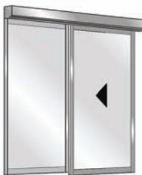
1-leaf sliding door with fixed leaf