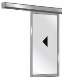
1-leaf sliding door