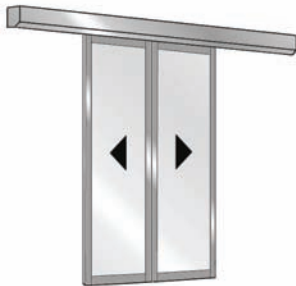
2-leaf sliding door